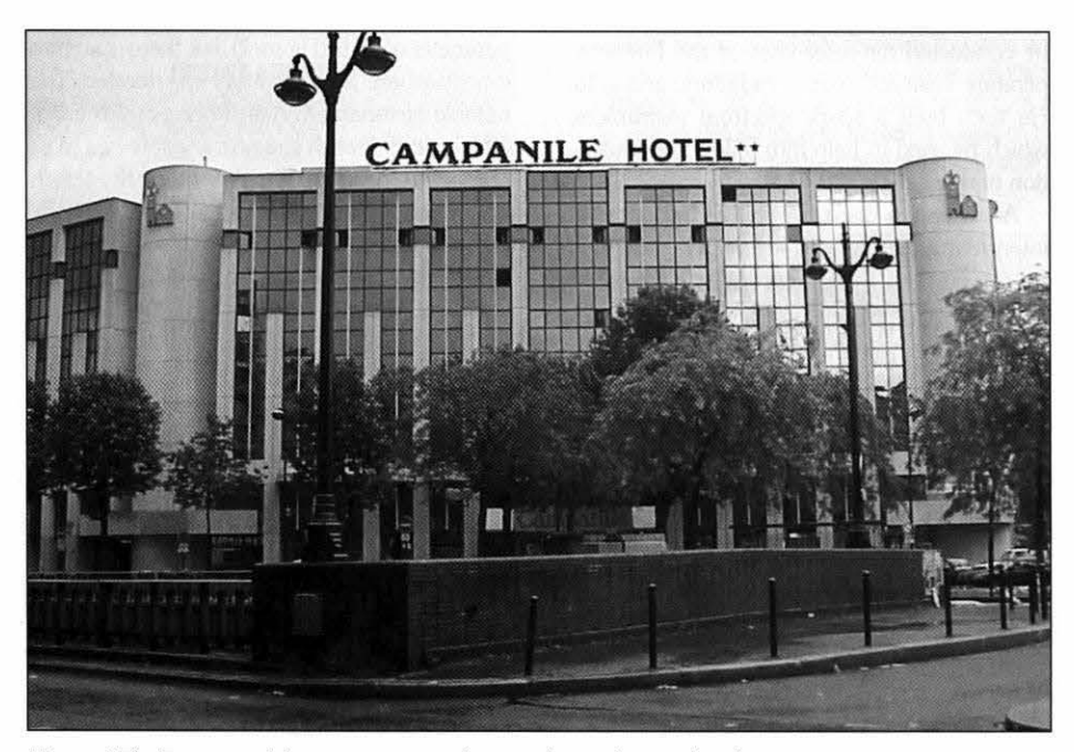
Figure 4. The Demarçay laboratory was once here on the north side of Boulevard Berthier, now occupied by a modern hotel.