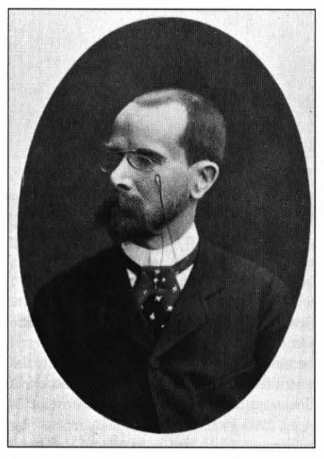
Figure 1. Eugène Demarçay (1852–1903), discoverer of europium.

Figure 2. At the time of Demarçay, the Boulevard Berthier was just inside the city limits of Paris, marked by a railroad encircling the perimeter of the city. It was at 2, Boulevard Berthier (N 48° 53.67, E 02° 18.78) that Demarcay built his independent laboratory where he conducted a number of researches including the discovery of europium and his spectral analysis of radium (in collaboration with the Curies).