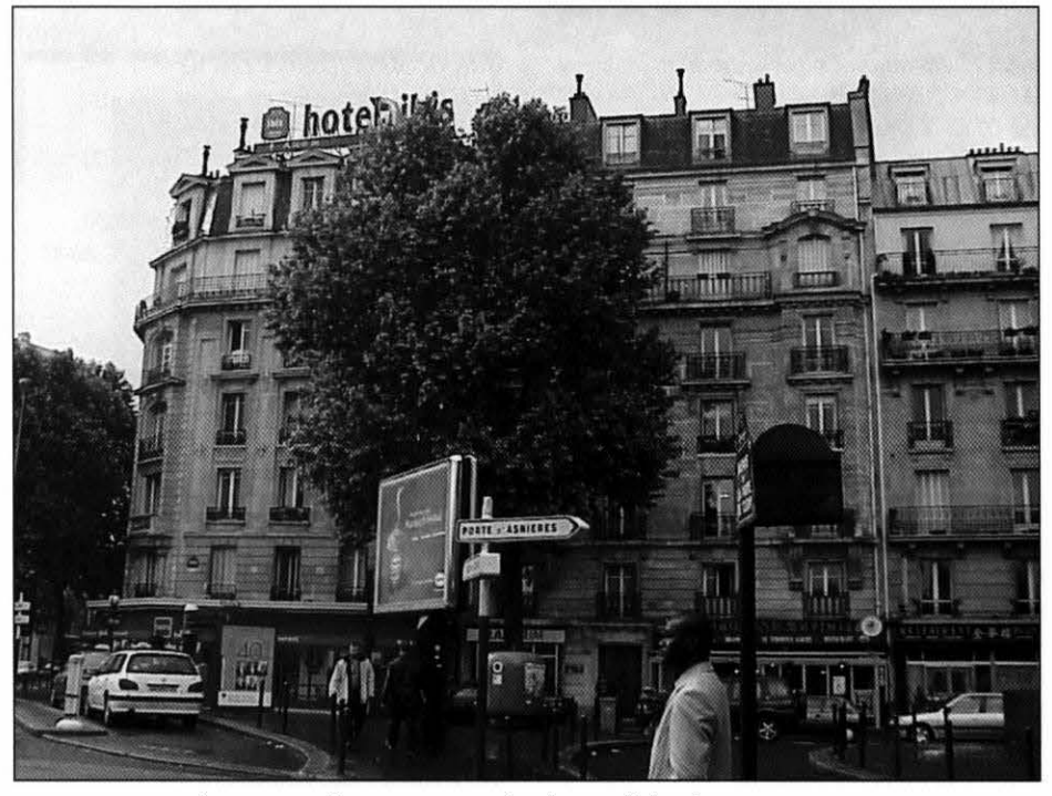
+Figure 5. Across the boulevard from the hotel, the buildings still date from Demarçay's time and most probably reflect the outside appearance of Demarçay's original laboratory.

Note 1. The literature is either silent<sup>1-2</sup> or is incorrect<sup>3</sup> (1904) regarding the year of death of Eugène Demarçay. The true vital dates, which came to light during this research, are 1852–1903 (born 1 January 1852, Paris; died 5 March 1903, at 80, Boulevard Malesherbes, Paris).